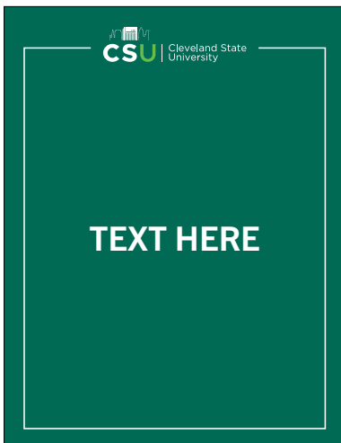
VERSION 1 (IN PORTRAIT VIEW)