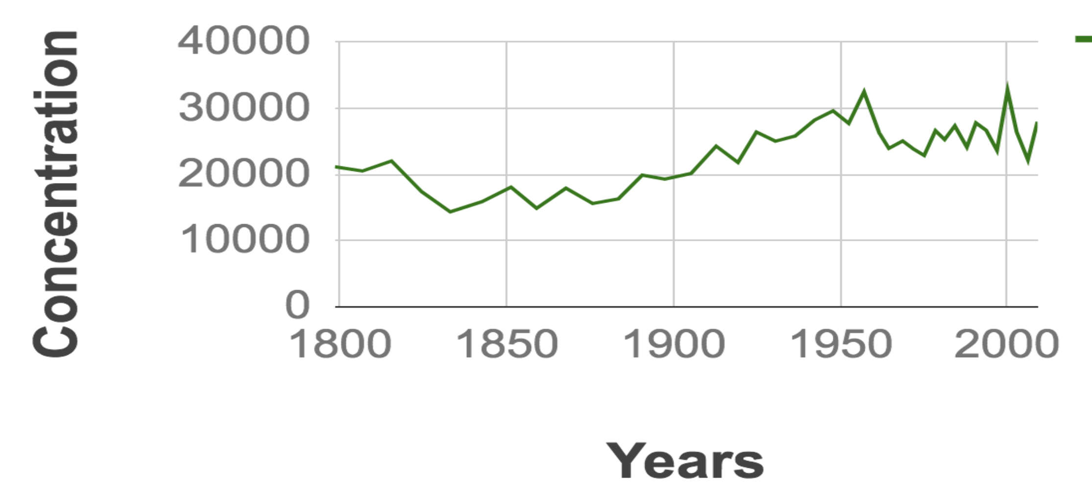
Year vs Amount of Aluminum